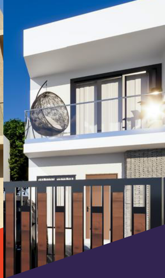
1941 NORTH LEGON