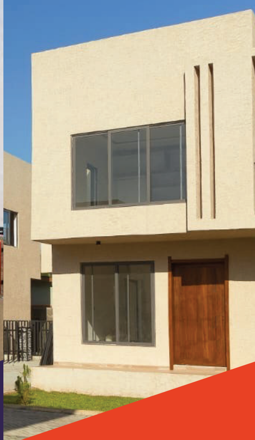
R & A HAATSO